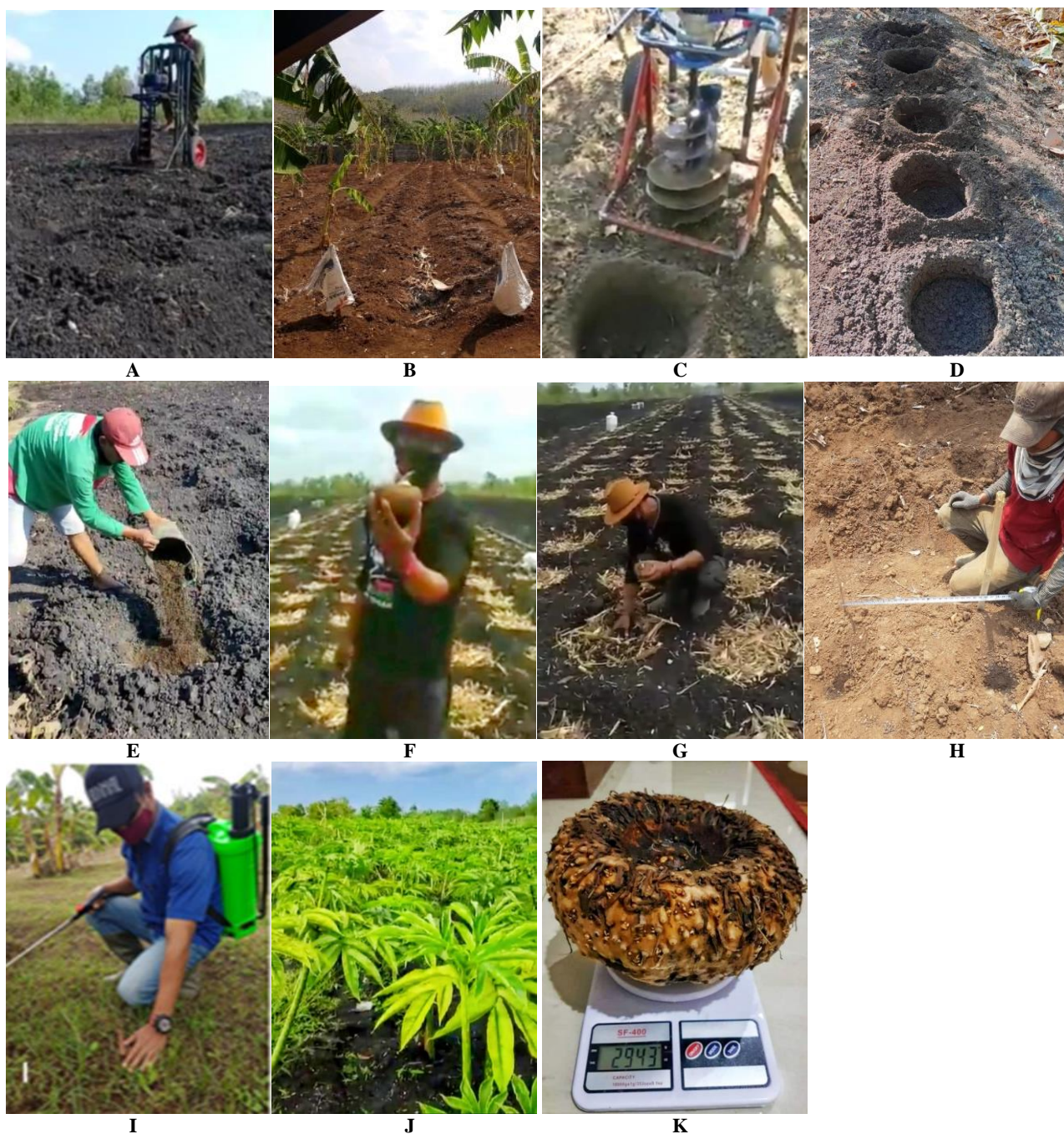
Figure 3. Stages of porang ( Amorphophallus muelleri ) cultivation. A. Soil loosening, B. Making beds, C. Hole making using a drill, D. Planting hole, E. Giving compost/manure, F. Selecting seeds from tubers, G. Planting seeds, H. Measuring planting distance, I. Fertilizing at 27 days after planting, J. Adult Porang plants, K. Harvested tubers

Porang cultivation is quite popular because it is quite adaptive in nature, easy to cultivate, and has high economic value. Porang plants can grow well in the Semarang area known as an area with various ecological conditions. Porang can thrive in cool and highlands such as Limbangan and Gunungpati areas as well as in hot lowlands such as Ngaliyan. However, like other members of Araceae, porang does not require prolonged exposure to the sun, for optimal growth porang must live 40-60% in the shade. In addition, according to Jansen et al. (1996) porang requires a good drainage system so that water does not stagnate which causes rot in the roots and tubers.