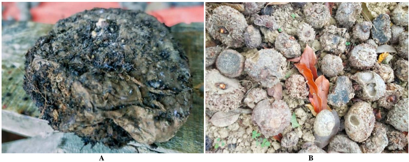
Figure 5. The porang tuber is not in a good condition. A. Porang damaged by rot, B. Porang damaged due to wrong storage methods