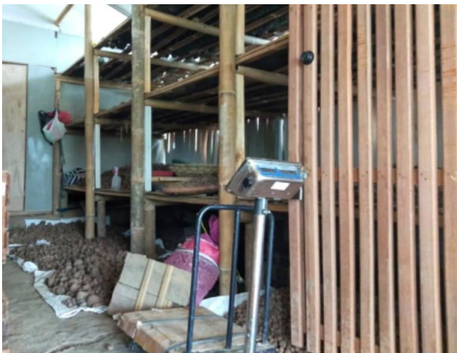
Figure 4. Porang storage area

The next step is making the planting hole and inserting the compost into the hole. Besides compost, some farmers also use a mixture of manure. The seed preparation stage includes selecting good seeds from tubers, bulbils ( katak ) and seeds (spores). In addition to planting porang in the usual way (one porang grows into one living plant), there are also farmers who plant porang by propagating it. One porang tuber seed from a katak can be multiplied into 4 seeds. There is also a special way for farmers to propagate. First, the porang katak seeds are cut into 4 parts. Then, the seed pieces are soaked in the blended shallot water and closed tightly for ½ day, then lifted and aerated. Next, the seeds are smeared with kitchen ash. Finally, when the seeds sprout, only then are they planted in the ground.