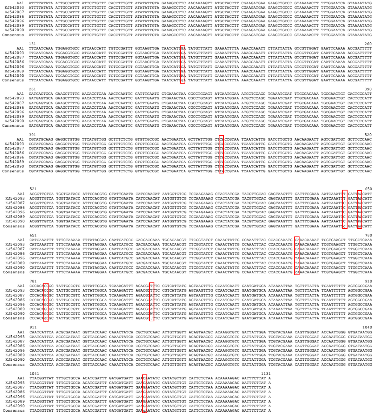
Figure 1. Alignment of Der p 1 allergen group 1 amino acid (Der p 1 proteins). The variation areas are indicated by a red block

to be done very carefully. In addition, these mutations mentioned above have previously been reported from several geographic regions, suggesting that polymorphisms in the Der p 1 gene are panmictic (Thomas 2010).