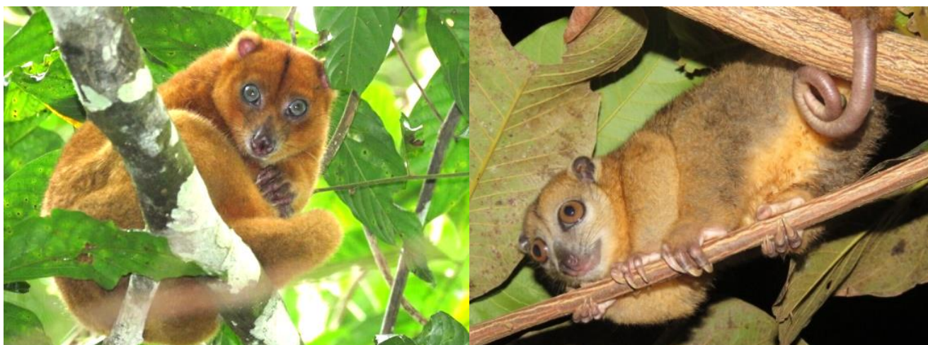
Figure 1. Cuscus ( Phalanger ornatus )

Saolat villagers live in the rapid development of communication technology online based. The spirit to have better life never ends and never fades from its social characters. However, the condition is not supported by the demographic data of its community such as education. They reach junior high school at the most, their livelihood as a fisher, copra farmer who work in others' land. They gain coconuts from surrounding land near TNAL forest. The income level of the community is relatively low while the living cost is very high. The Central Bureau of Statistics stated that Halmahera island is in the third position of the high living cost, the living cost in Ternate reaches Rp 6.4 million/per month (BPS 2017).