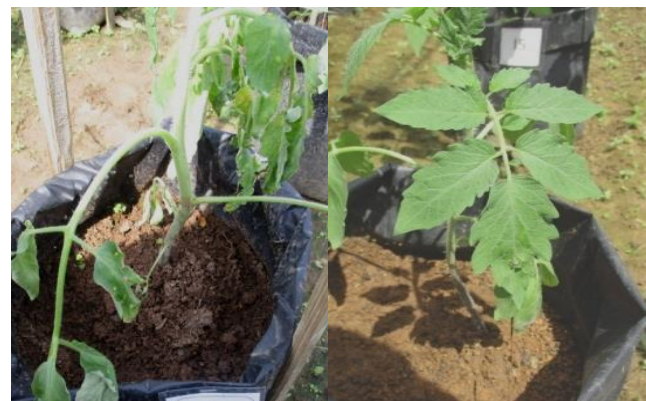
Figure 3. Ralstonia syzygii subsp. indonesiensis disease development on tomato treated with C1 consortium (right) and control (left)

Note: *= no symptoms appear until the last day of observations