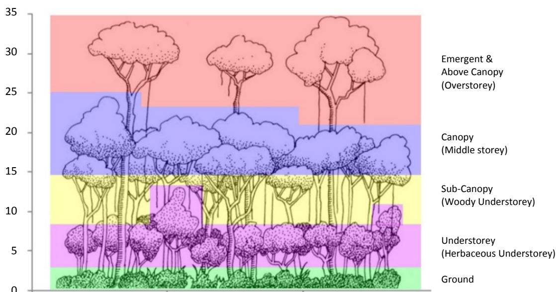
Figure 3. The space division layer of forest canopy in use by birds (Pearson 1971)