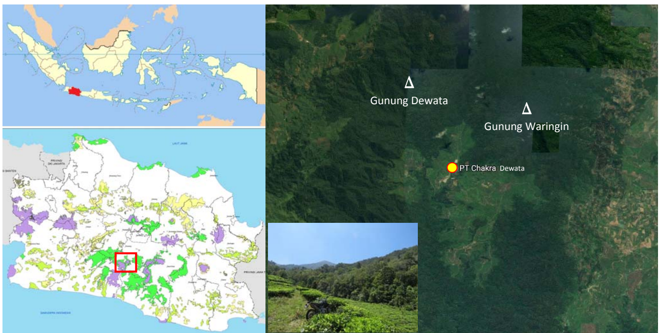
Figure 1. Research area in the Mount Tilu Nature Reserve, West Java, Indonesia. Insert: PT. Chakra Dewata tea plantation

The data were analyzed by using a diversity of species diversity index of Shannon-Wiener (Magurran 1988), a community of species similarity index (Sorensen 1948). The use of space by virtue of the bird analyzed index (Natarajan and Jhingran 1961), and the use of selection space (Jacobs 1974).