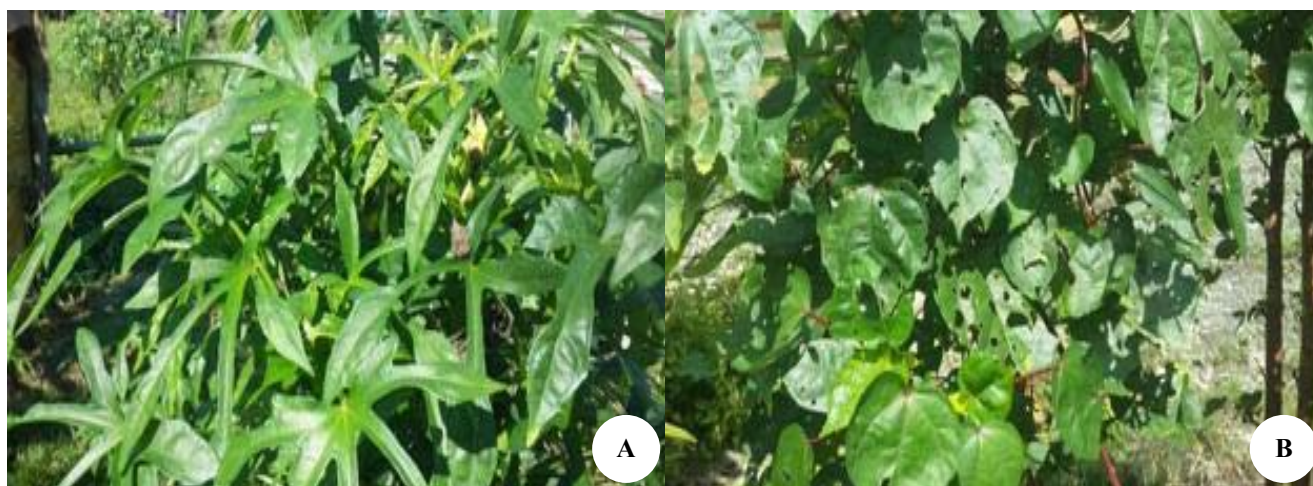
Figure 3. A. Aibika cultivars with deep lobe leaf was marketed as a leafy vegetable; B. Less marketed cultivar due to highly sap content

banana, and various vegetable crops. With a cropping pattern like this, plant spacing is not applied on a regular basis, but a few farmers use spacing of 100 \times 100 cm for Aibika. The tool used to make holes for planting is made from a wood stick with a length of about one metre. No fertilizer is used for improving the growth of Aibika.