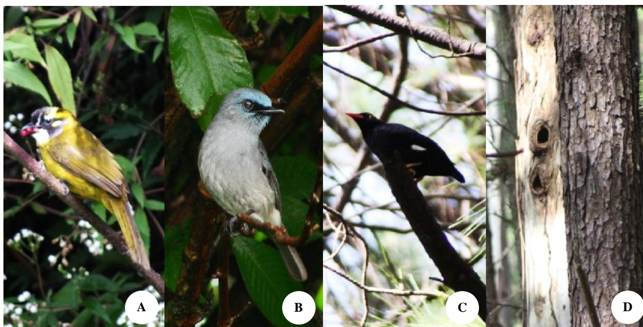
Figure 2. A. Yellow-eared Bulbul ( Pycnonotus penicillatus ), B. Dull-blue Flycatcher ( Eumyias sordiduse ), C. Sri Lanka Myna ( Gracula ptilogenys ), D. Nesting hole of Sri Lanka Myna.

Nevertheless, the number of species recorded in this study is relatively higher than expected. This could be due to the presence of considerable amount of undergrowth that has resulted from less human intervention. Moreover the landscape in which this plantation located has a forest matrix. Therefore a greater variety of bird species are present within the area even to utilize the slightest resources present in this plantation. Asian Black Bulbul and Sri Lanka Myna ( Gracula ptilogenys ; Figure 2C) were frequently observed in pinus plantations. Few eucalyptus trees located within the pinus plantation site have provided nesting holes for Sri Lanka Myna, and have caused a considerable increase of this population within this habitat type (Figure 2D).