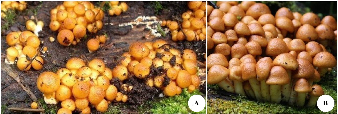
Figure 1. Pholiota microspora . var. himalensis var. nov. A. Basidiocarps (young) on Quercus log in natural habitat, B. Basidiocarps (full grown)