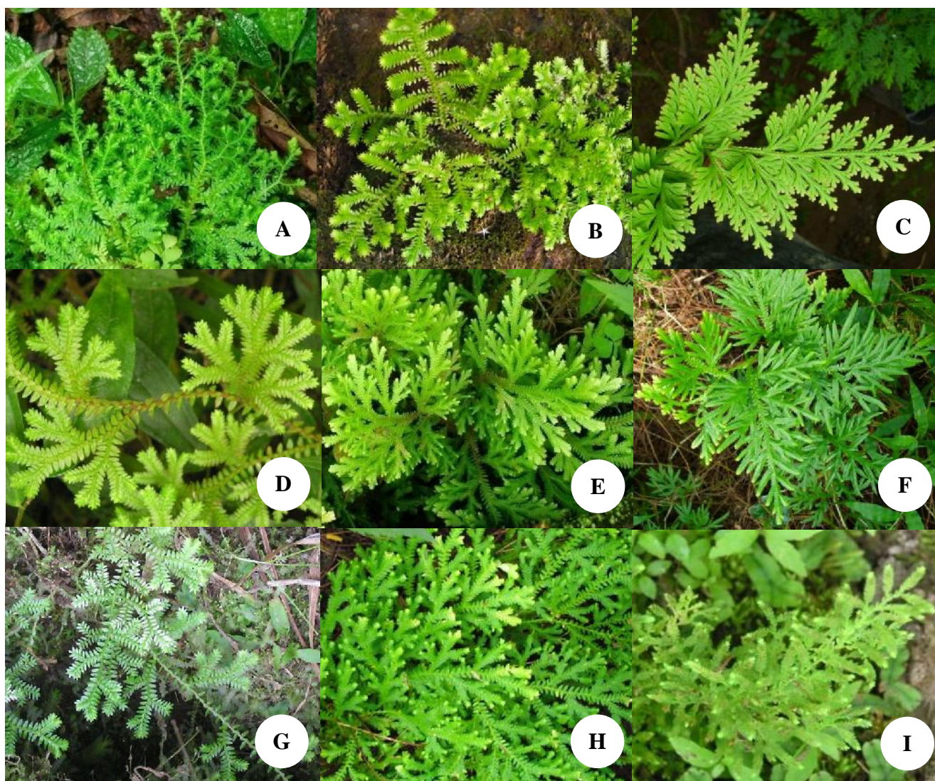
Figure 2. Species diversity of selaginellas in Mount Lawu and the surrounding; A. S. aristata , B. S. ciliaris , C. S. involvens , D. S. opaca , E. S. ornata , F. S. plana , G. S. remotifolia , H. S. singalanensis , and I. S. zollingeriana .

It is a robust perennial herb, erect with stoloniferous rhizome, without branches on the lower half, from a very widely creeping shallow subterranean branching rhizome to